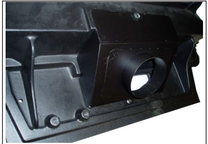
Figure 2 - Install Air Adapter and Replace Bolts