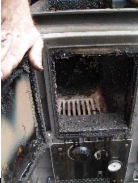
Tar on loading door glass