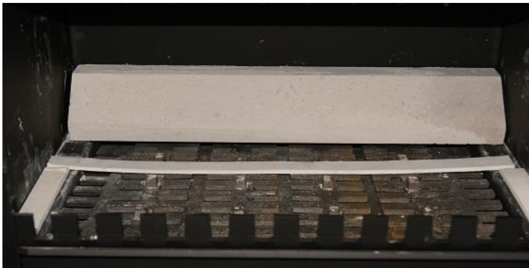
1, Fit the rear base brick