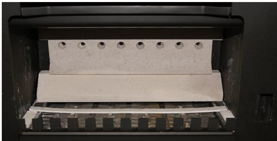
2, Locate rear brick on top of base .