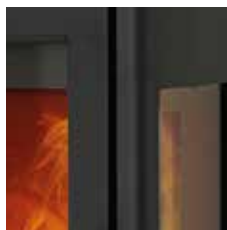
Side windows provide panoramic flame views