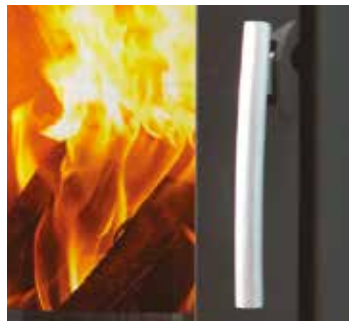
Ergonomically designed handles