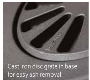
Cast iron disc grate in base for easy ash removal

Please note, the blanking plate for VARDE Shape 2, VD-100473, is available as an optional extra.