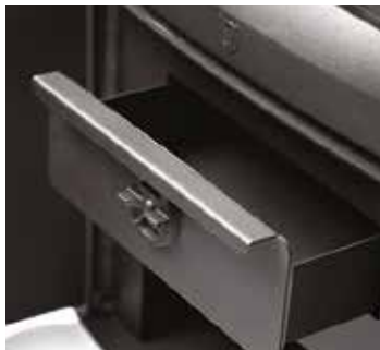
Large capacity ash pan