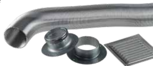
Optional External Air Connection - 80mm

An approved competent person of solid fuel installations should undertake a site survey prior to purchase and must install any VARDE Stove for you. Your VARDE retailer will be able to advise and assist. You may view/download complete installation instructions at our website - www.VARDEstoves.com . These diagrams/dimensions cover some of the basic requirements. All stoves should be installed by a competent person to the requirement of Building Regulations (Document J) and include the fitting of adequate ventilation to ensure safe use. Usually older buildings do not need any additional ventilation for appliances up to 5kW, but modern houses will need additional ventilation in all cases. Some models can be fitted with an optional External Air Kit, or dedicated external air supply, offering a discreet and draught reducing solution to standard room venting.