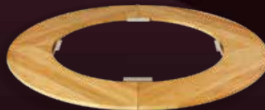
SOLID OAK RING