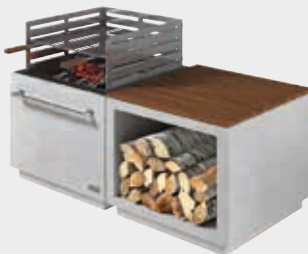
Air - BBQ Grill Suite (965-010) Horizontally configured with optional wooden top (965-140)