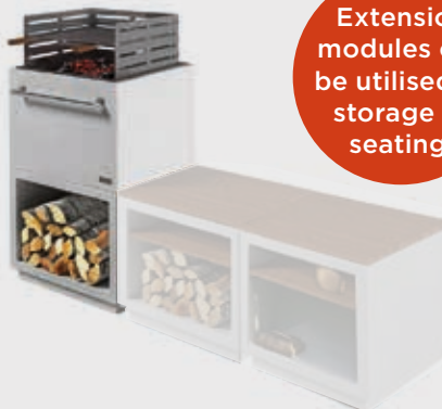
Air - BBQ Grill Suite (965-010) Vertically configured with 2 x Extension modules (965-032), 2 x optional wooden tops (965-140) and 2 x optional wooden shelves for log store (965-199)

Extension modules can be utilised as storage or seating!