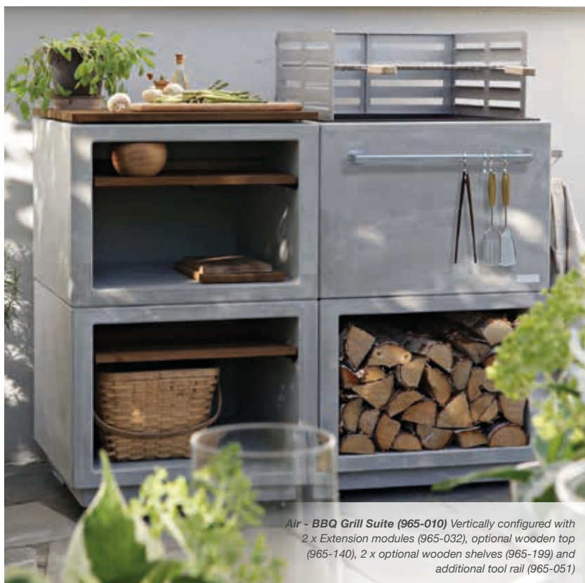
Air - BBQ Grill Suite (965-010) Vertically configured with 2 x Extension modules (965-032), optional wooden top (965-140), 2 x optional wooden shelves (965-199) and additional tool rail (965-051)

Barbecue models come with a windbreak and steel grill for open-air cooking, plus a sleek steel tool rail for hanging those essential barbecue utensils. To keep your barbecue looking its best, a supplied protective anti-drip strip can be fitted with ease, keeping oil and food away from the concrete base. An optional sizzle plate (see bottom right) can be selected for a versatile cooking surface, while the extension modules can be used as a log store base for easy access to firewood to keep the heat going - or even configured for use as stylish bench seating in a horizontal configuration.