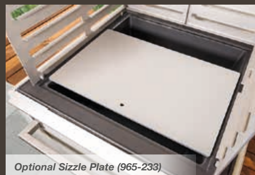
Optional Sizzle Plate (965-233)