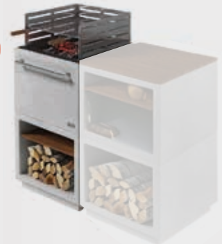
Air - BBQ Grill Suite (965-010) Vertically configured with 2 x Extension modules (965-032), optional wooden top (965-140) and 2 x optional wooden shelves (965-199)

Extension modules can be utilised as storage or seating!