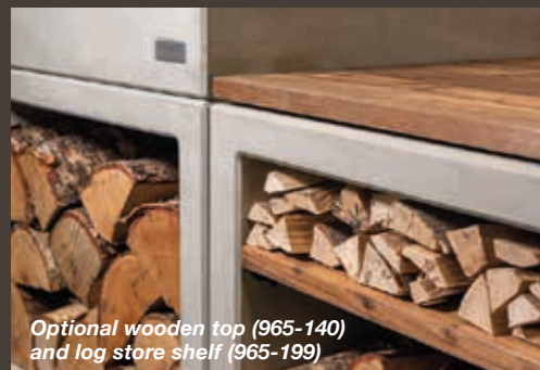
Optional wooden top (965-140) and log store shelf (965-199)