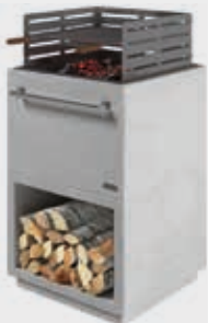
Air - BBQ Grill Suite (965-010) Vertically configured.