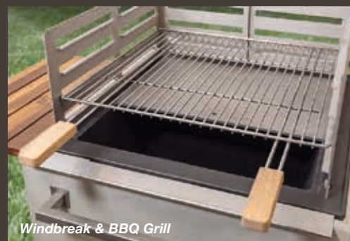
Windbreak & BBQ Grill