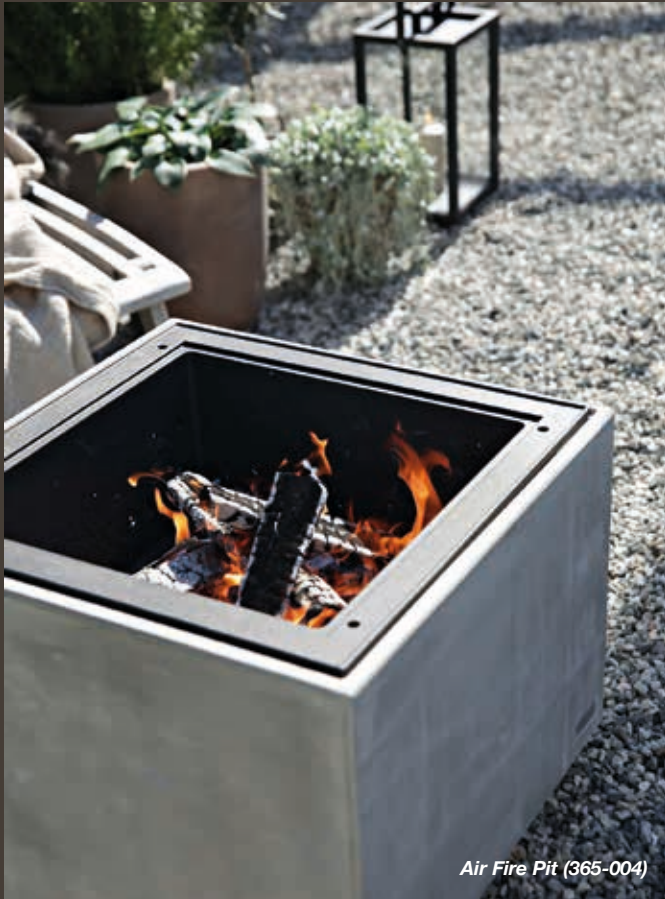
Air Fire Pit (365-004)