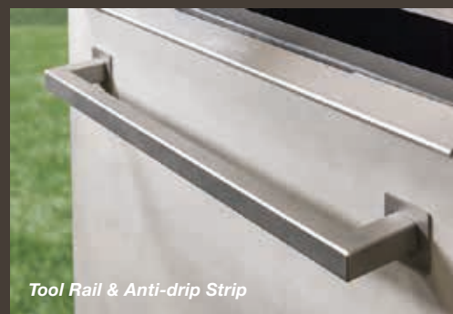
Tool Rail & Anti-drip Strip